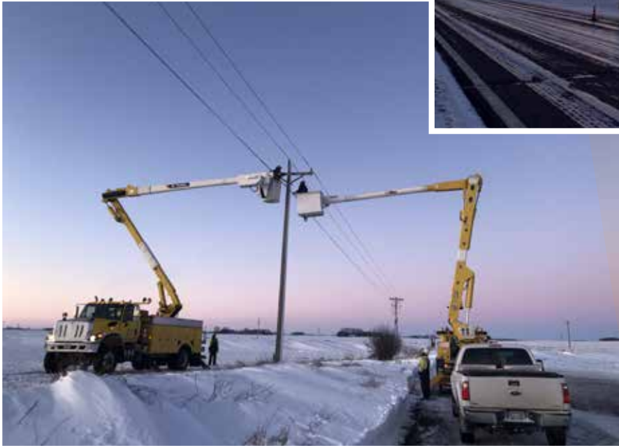
Minnesota Valley Electric linemen assisted with storm restoration.

Renville-Sibley appreciates your patience while the linemen work as quickly and safely as possible to restore power during any power outage situation.