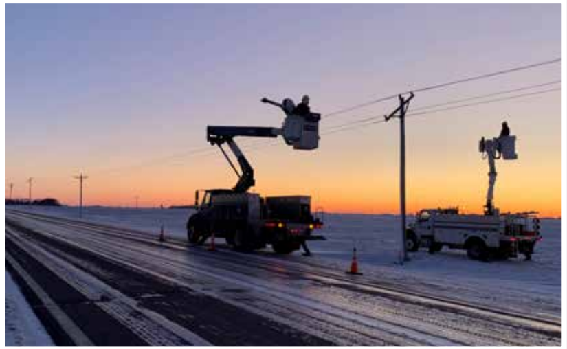
Renville-Sibley and Redwood Electric linemen work together to repair a broken cross arm.

In total, there were over 470 power line issues including broken bolts, insulators, ties, conductors, cross arm pins and pole top pins. There were 33 outages affecting 2,396 member locations, which is more than our total number of locations. Many members experienced