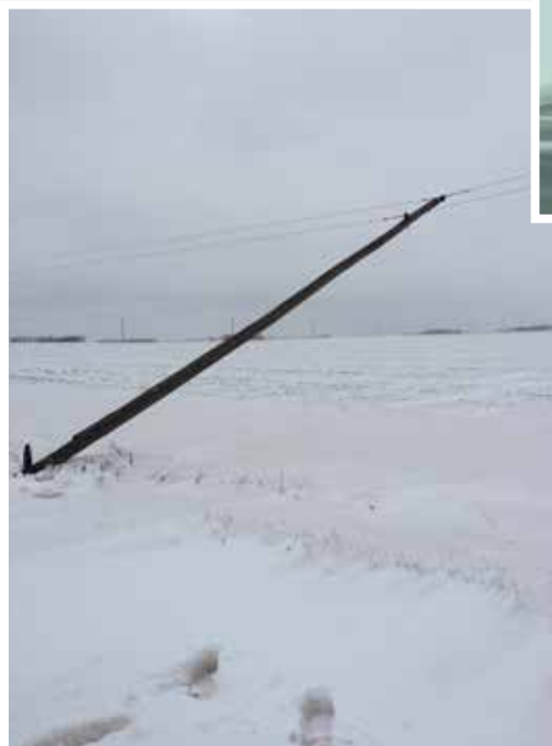
A total of 14 poles were broken during the April storm.

Cairo Substation, one to the Birch Cooley Substation, and another to the Kingman Substation. The crews patrolled the lines and made necessary repairs to restore power to the members. Some of the members in the Cairo and Birch Cooley areas lost power multiple times. The Kingman Substation outages were only on one circuit. The crew found a broken insulator and wires galloping. This insulator was repaired around 6:00 pm Thursday night. The crews continued work in the Cairo and Birch Cooley areas until all power was restored. This round of power outages was restored around 1:00 am Friday morning.