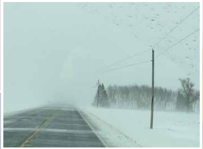
Winds blow the power lines causing the lines to gallop.

We knew from the previous night that 3-mainline 3-phase poles were broken on the major tie line between Cairo and Birch Cooley Substations. This is the mainline for a contingency to